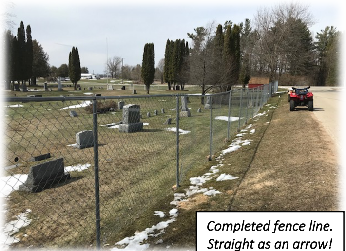
Completed fence line. Straight as an arrow!