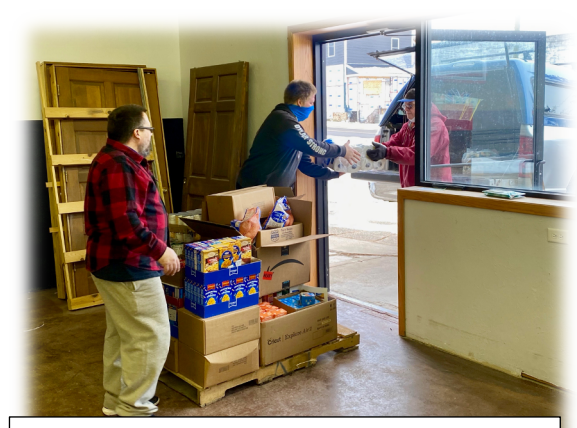
Moving Day for the New Food Pantry! God's Work, Our Hands!