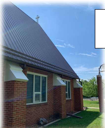
The roof has been fixed and new gutters have been installed.