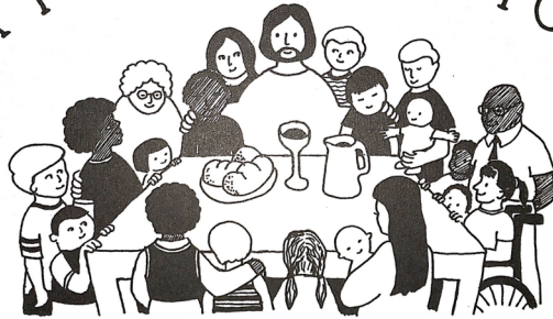
A PLACE FOR YOU

“The body of Christ, given for you. The blood of Christ, shed for you.”