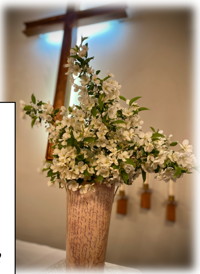
The flowers appear on the earth, the time of singing has come, and the voice of the turtledove is heard in our land. Song of Solomon 2:12