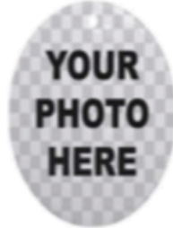
Your Name Here Our Next Treasurer!