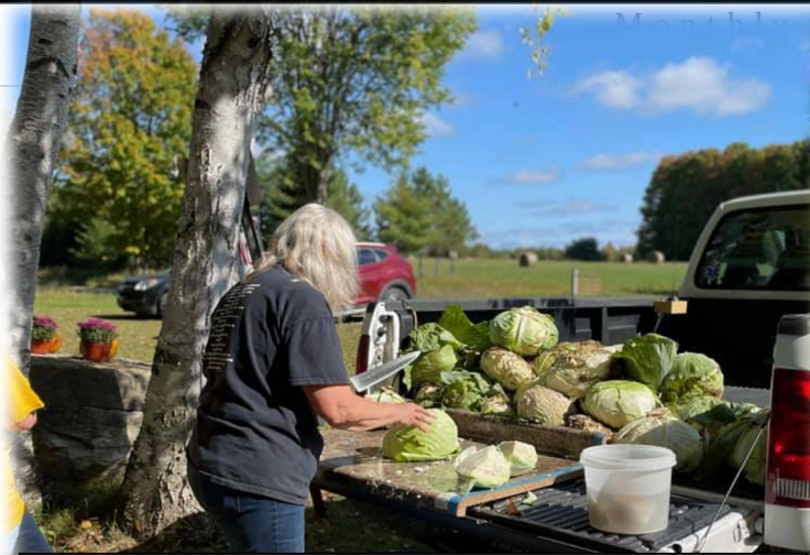
NEVER mess with a woman and her knife! Let the quartering of the heads begin!