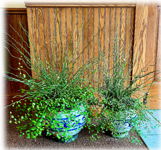
Check out the beautiful plants near the Highway 41 entrance! Cool spirals!