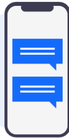
Text Message (SMS)