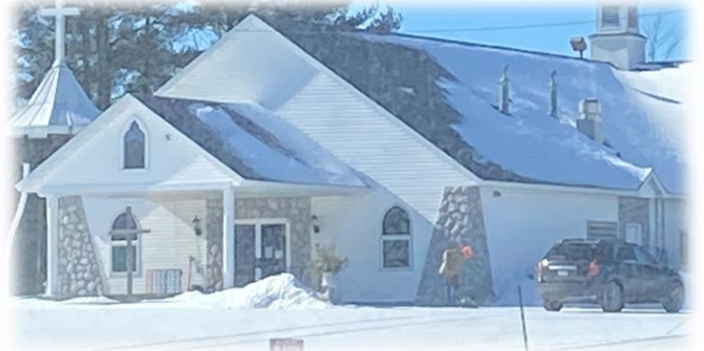
Thanks for keeping those entryways shoveled, Jim!