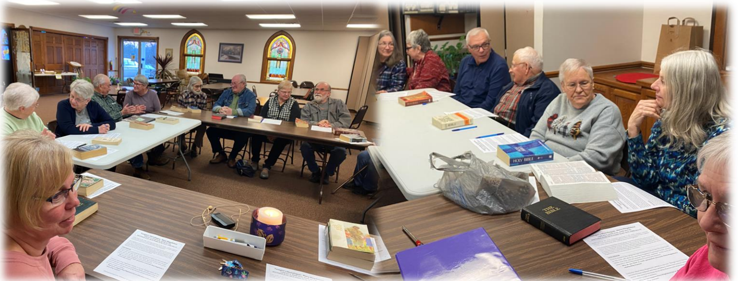
Adult Faith Formation classes on Wednesday evenings mean full, Fellowship Halls once again!