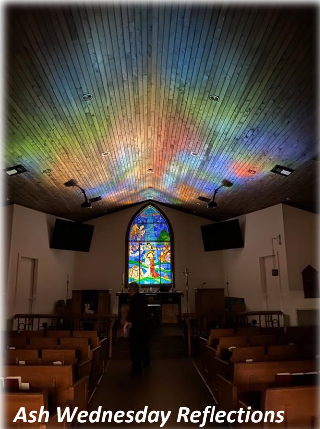
Ash Wednesday Reflections