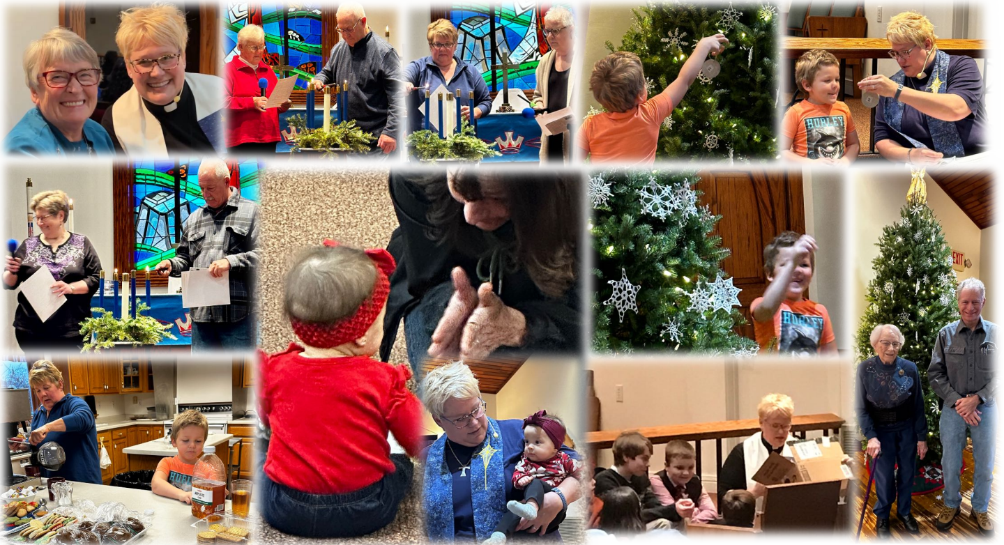
The Advent Candles are lit and the Christmas Tree is decorated!