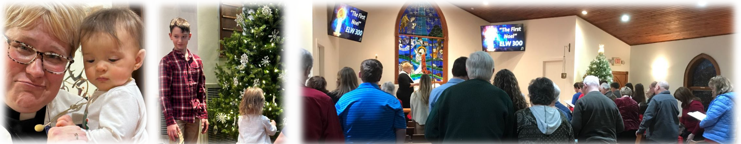
Children of all ages join in the fun of the season and share the Love of Christ!